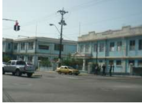
22-26 Victoria Avenue, Kingston